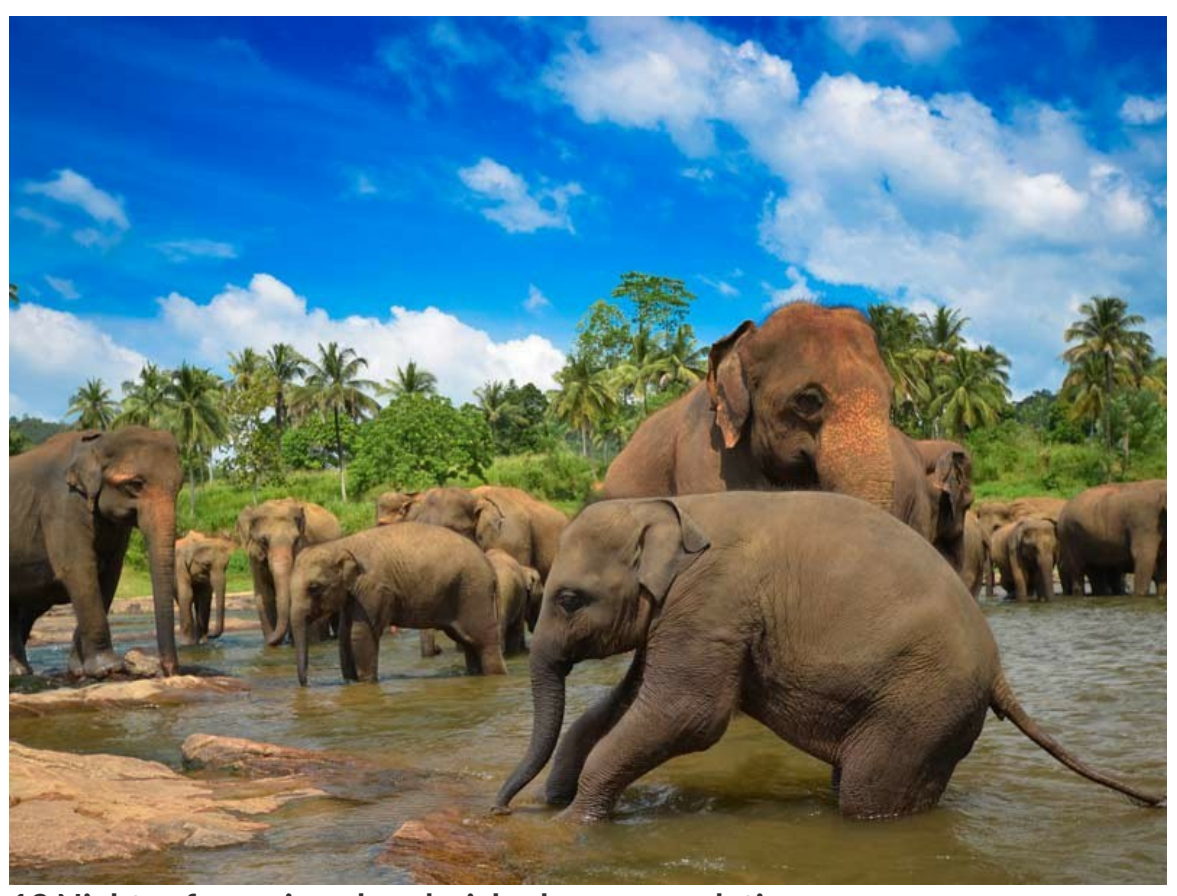
12 Nights of premium, hand-picked accommodation Visit a range of exciting, UNESCO World Heritage Sites Experience a jeep safari in Minneriya & Yala National Park Enjoy an iconic train ride through the Sri Lankan hills

From $2,999 Typically $3,999 pp twin share