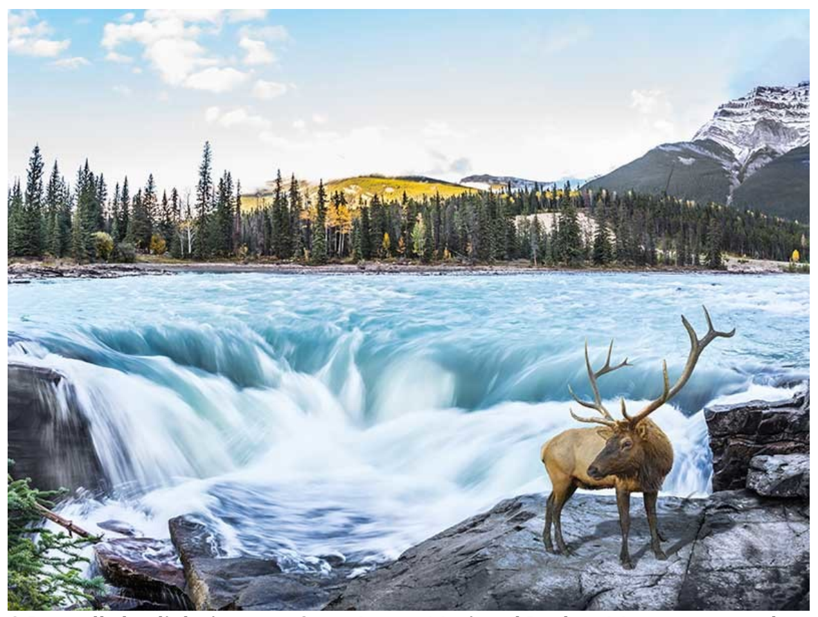
2 Day, all-day light journey from Jasper National Park to Vancouver on the Rocky Mountaineer

From $6,699 Typically $8,899 pp twin share